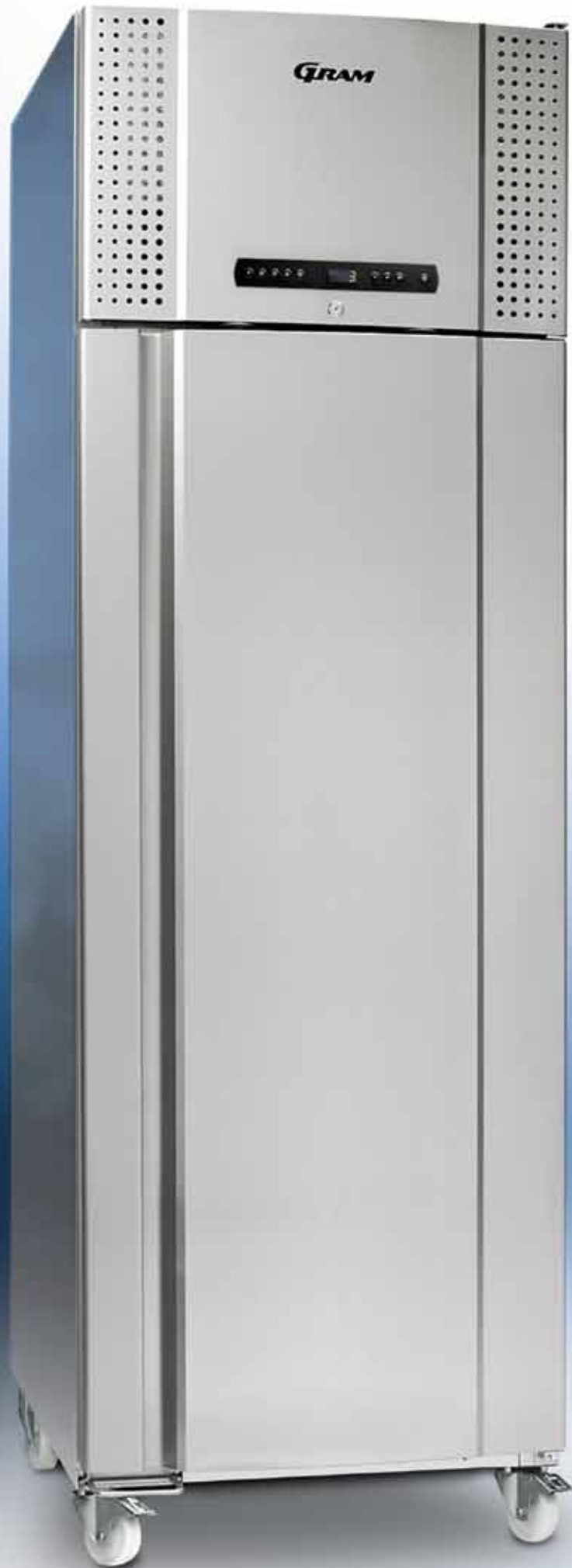
PLUS 660 CX