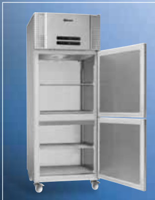
TWIN 660 COMBI-CABINET

Combine 2 temperature ranges in one cabinet. The Combi-cabinet from Gram offers you the ultimate in food storage flexibility.