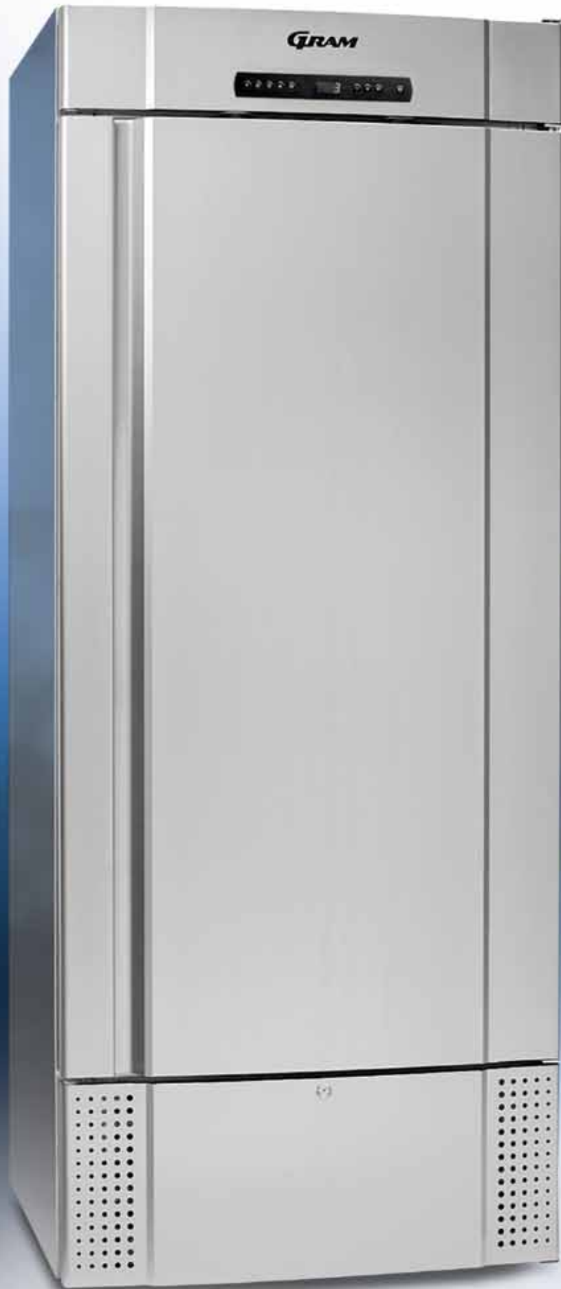
MIDI 625 CX