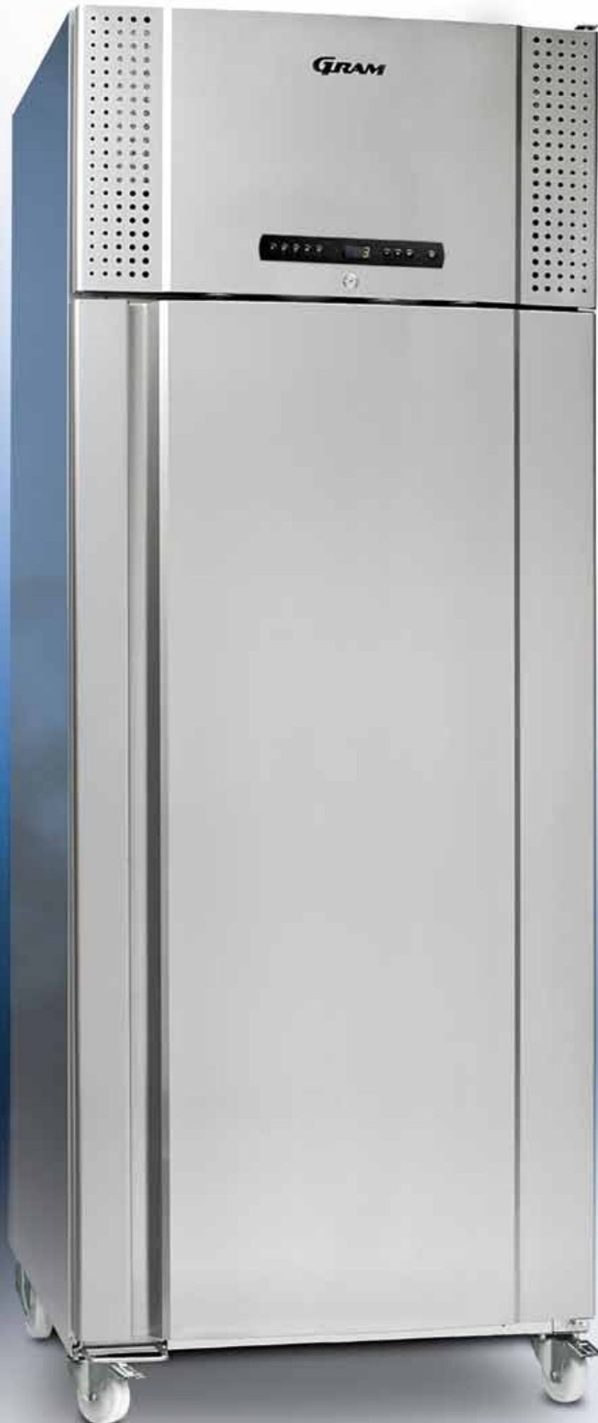
TWIN 660 CX