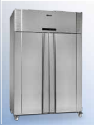
PLUS 1400 CX