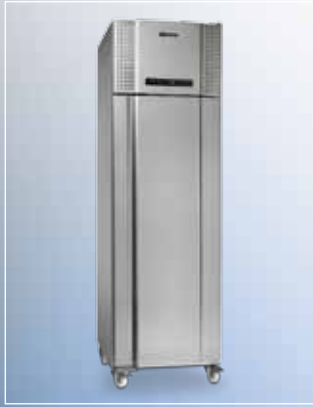
EURO 500 CX